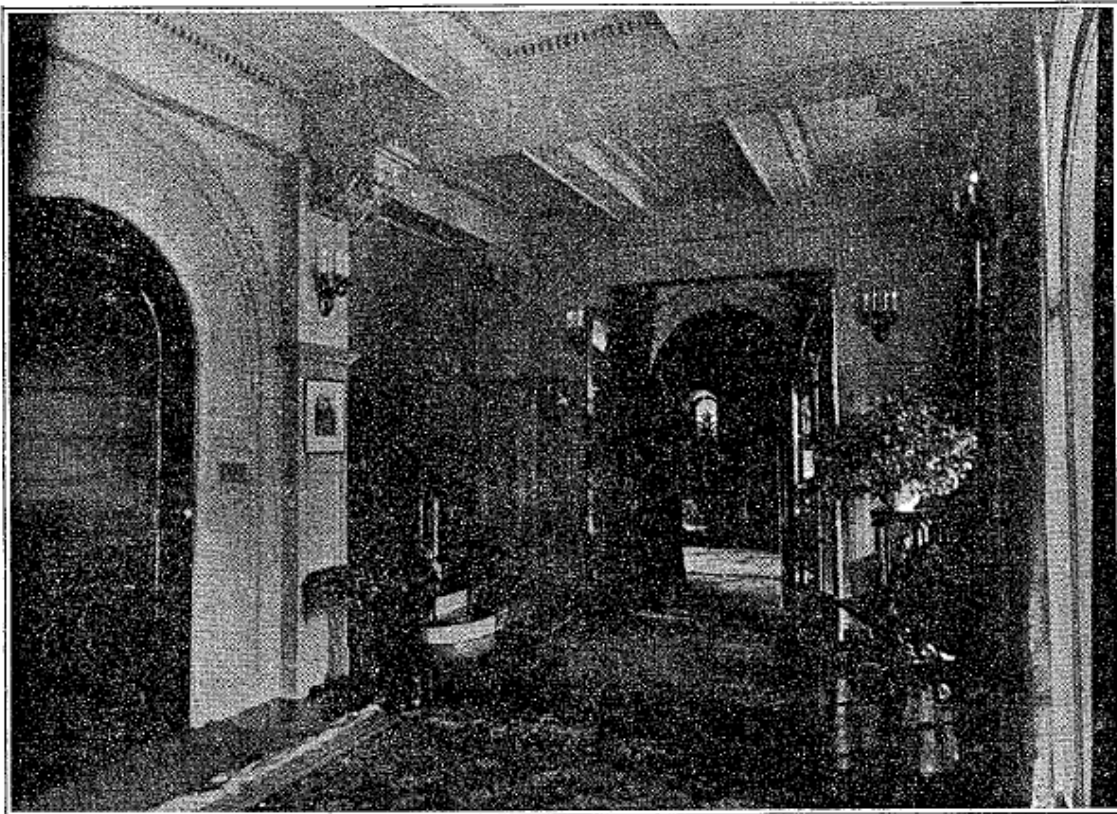
INTERIOR OF NEW LODGE OF DELTA DELTA