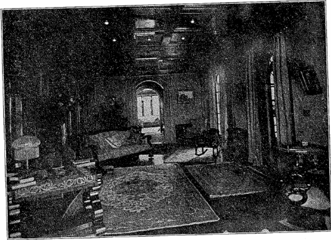
INTERIOR OF NEW LODGE OF DELTA DELTA