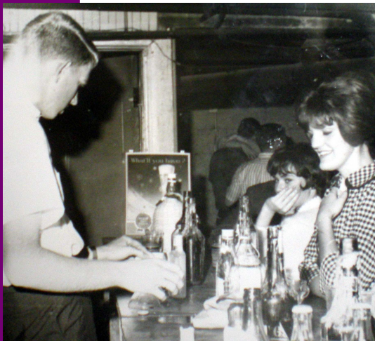
All Alpha Weekend 1963

Who are these brothers? What was the story? Tell Us!