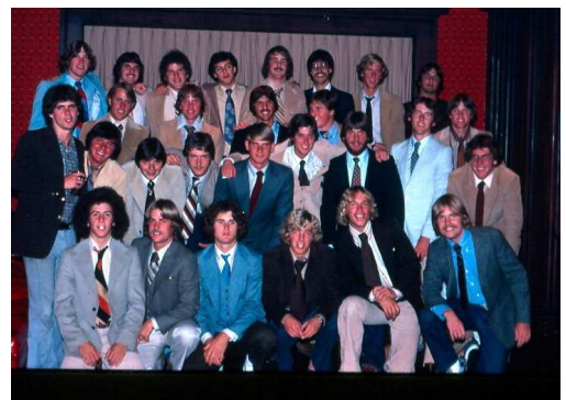
Unidentifiable Photo from 1980s