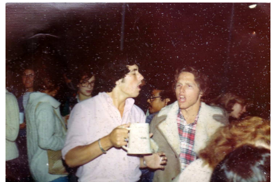
Fall Deck Party 1975

Who are these brothers? What was the story? Tell Us!